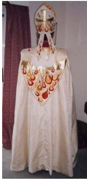
A selection of copes produced to customers own specification or design.