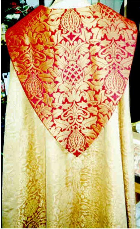
Gold Glastonbury Cope trimmed with red and gold Fairford Brocade