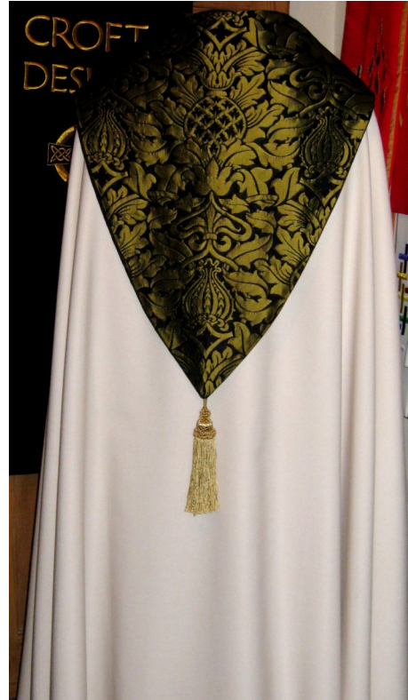
Ivory plain weave cope trimmed with black and gold Fairford Brocade