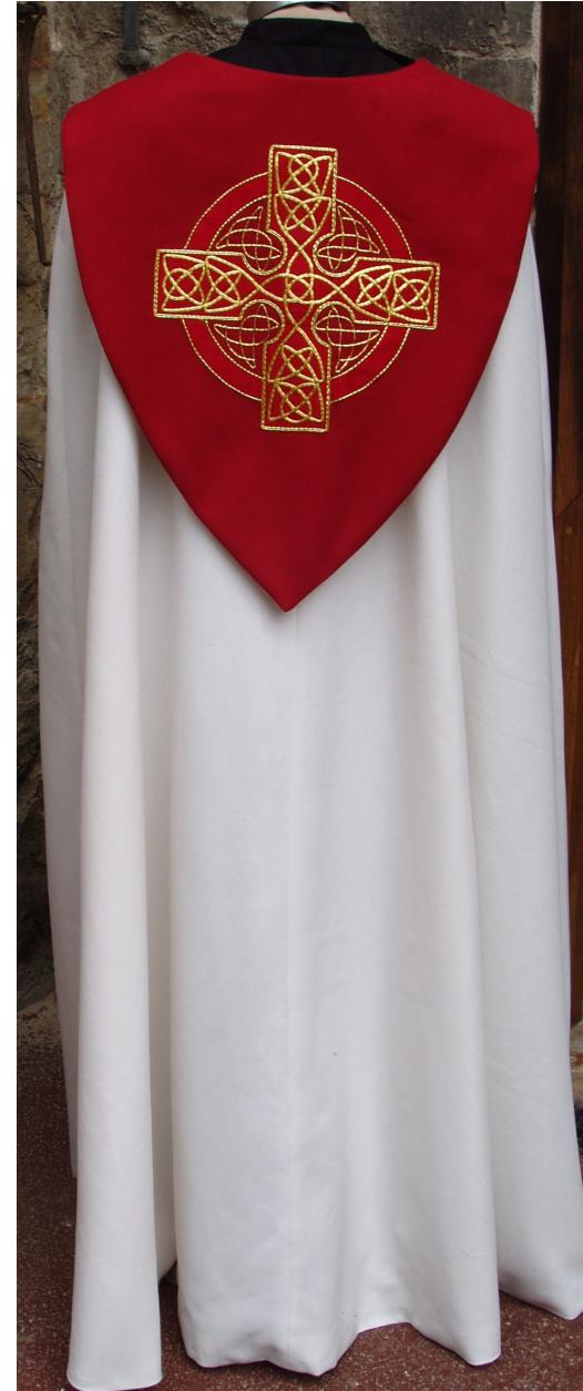
Plain weave cope with silk orphreys and shield. Custom design ornate Celtic cross on the shield and fine knot work to the front orphreys.