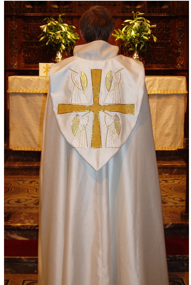
Ivory silk cope with embroidered shield

Commissioned by St George's Edgbaston 2007