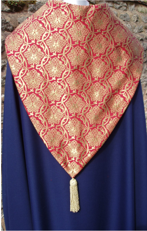
Blue plain weave cope Trimmed with red and gold St Hubert Brocatelle.