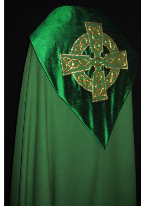
Plain weave cope with pure silk orphreys and shield.