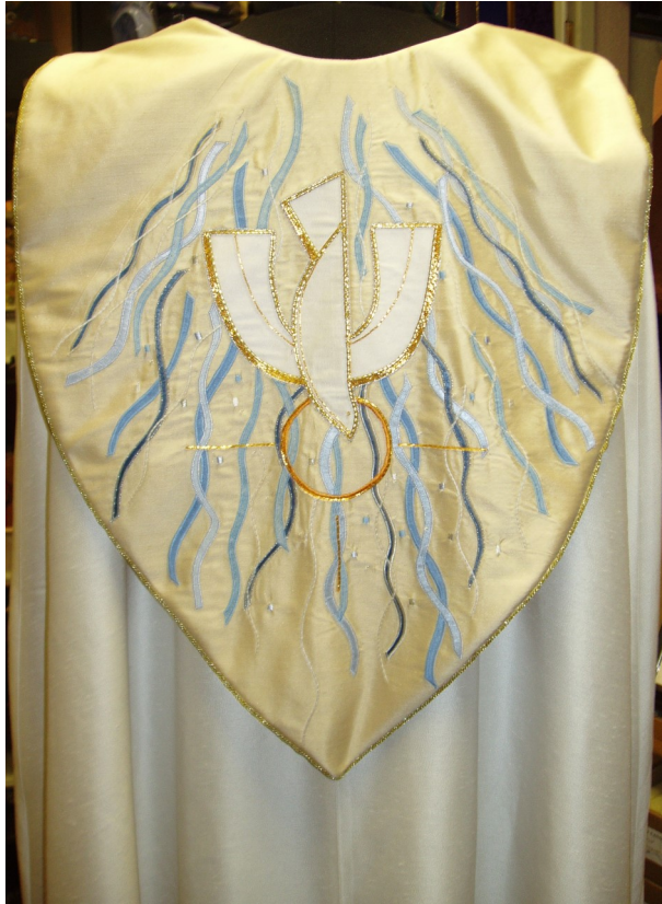
Ivory silk cope with cream silk orphreys and embroidered shield.