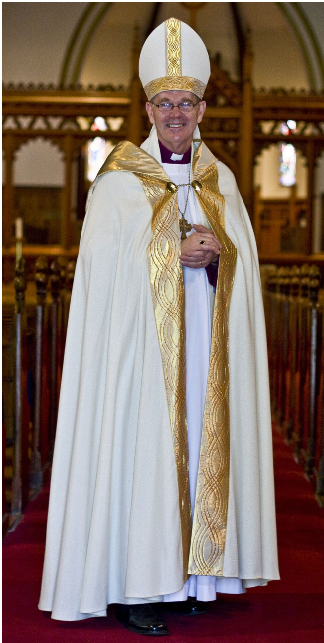
Light weight cope with embroidered silk orphreys and shield.

Commissioned by Rt Revd Paul White Bishop of Melbourne, Australia.