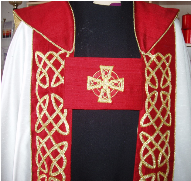
Ivory silk cope with red pure silk orphreys and shield. The orphreys have a heavy Celtic knot and the shield a Celtic goose.